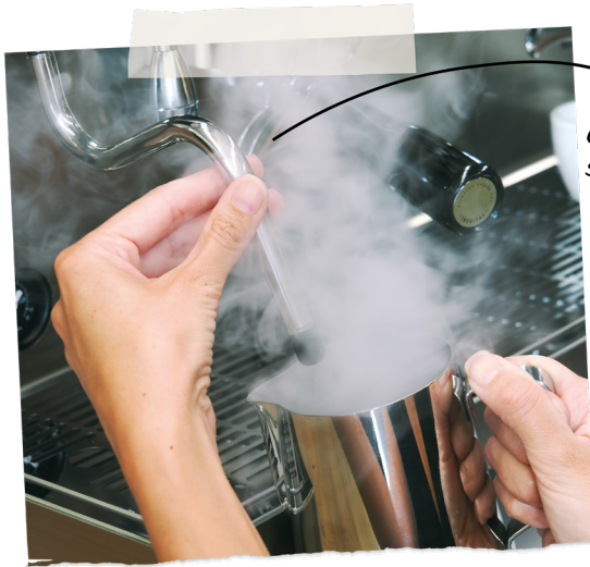
Cool touch steam wand