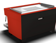
TERRACOTTA BARISTA/ BLACK (back)